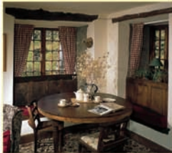
Pelton Wheel Cottage The Coppermines