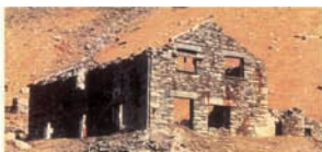
In the beginning !