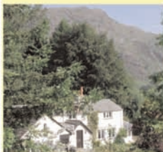
Fairsnape Cottage sleeps 2 - 10

Experience timeless romance & a breath of fresh air !